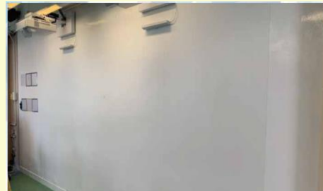
Size: 4880(W) x 2200(H) mm Photo taken at The Education University of Hong Kong Jockey Club Primary School

Frameless Non-reflective soft whiteboard wall