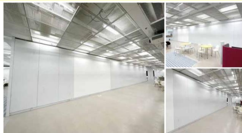
Size: 6000(W) x 3100(H) mm Photo taken at The Chinese University of Hong Kong

Vertical Whiteboard panels with hidden door